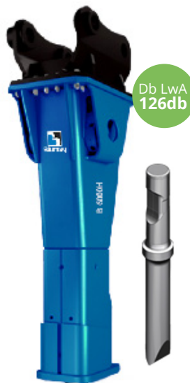
B6000HB 6.200 kg.