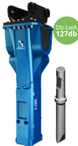
B45HB 2.547 kg.