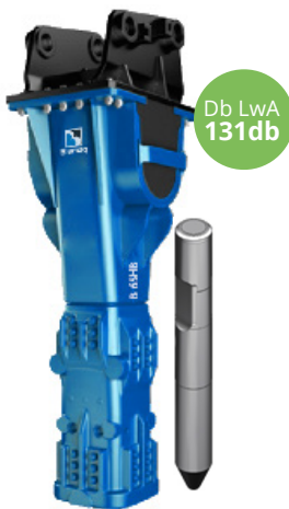
B65HB 5.589 kg.