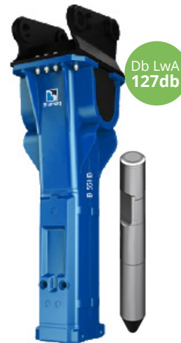
B55HB 3.430 kg.