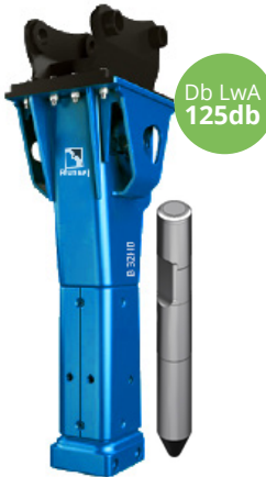
B32HB 1.450 kg.