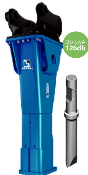
B7000HB 7.754 kg.