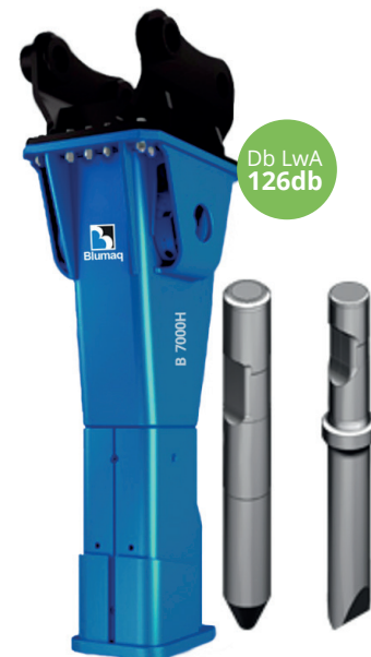
B7000HB 7.754 kg.