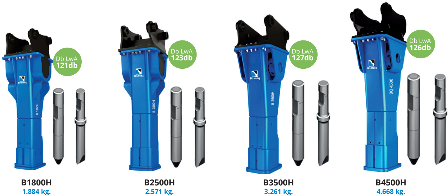
B1800H 1.884 kg.