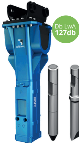
B45HB 2.547 kg.