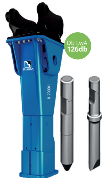
B7000HB 7.754 kg.

2 working tools / centralized greasing / Nitrogen-filled chamber. Preloaded / Mounting bracket (without working tool) / Steel spring protected hoses with quick connect coupling