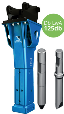
B32HB 1.450 kg.