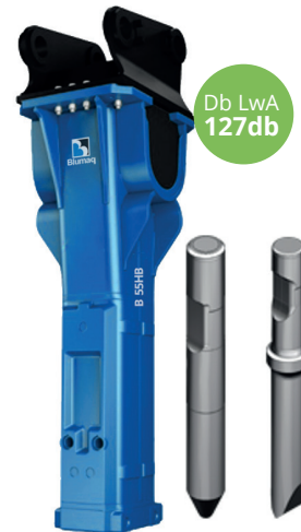
B55HB 3.430 kg.