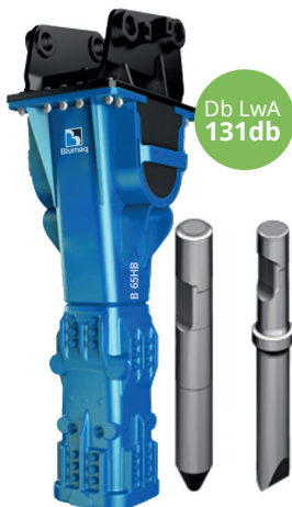
B65HB 5.589 kg.