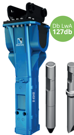
B45HB 2.547 kg.