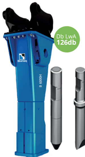
B6000HB 6.200 kg.